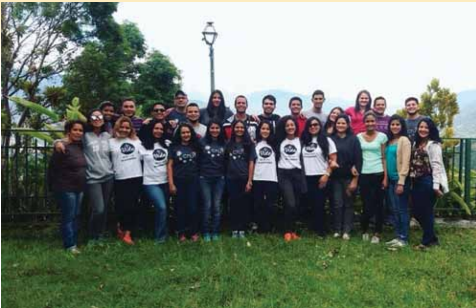
SLM Team Venezuela 2017