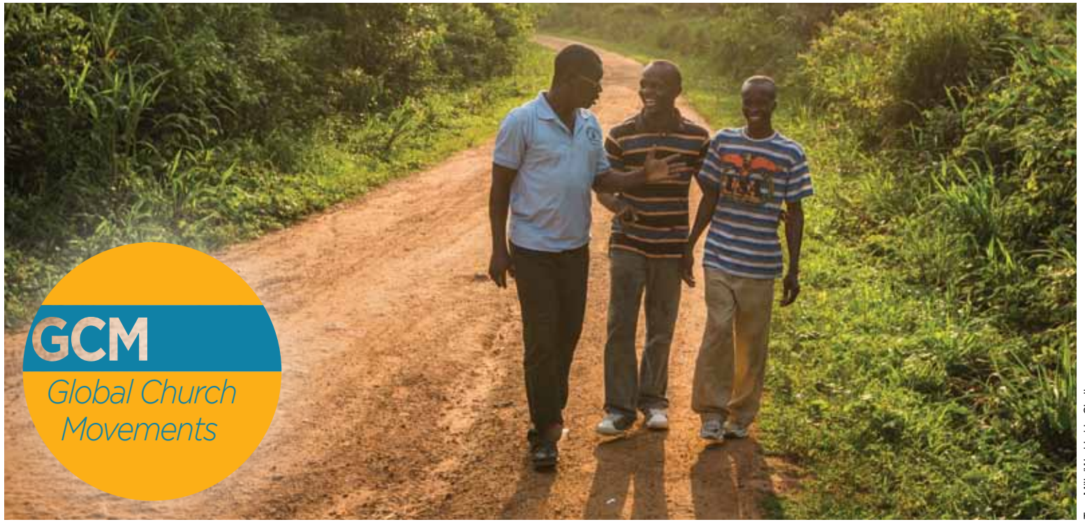
Tom Mills/Worldwide Challenge